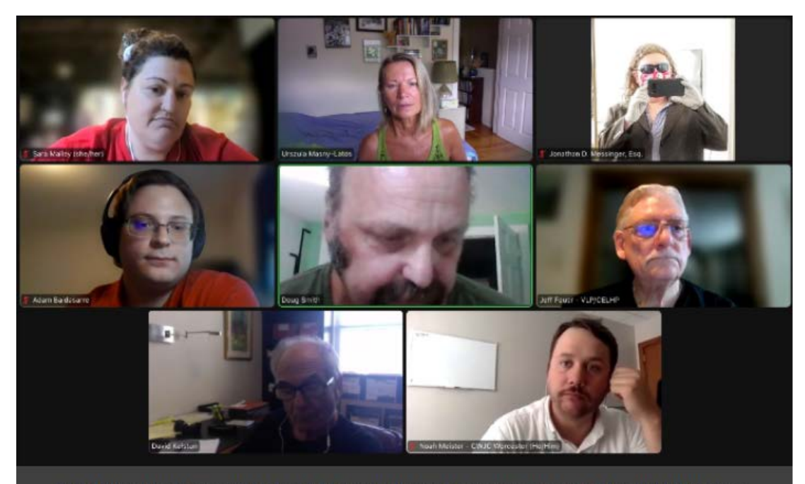
The Litigation Committee hard at work discussing current and potential initiatives.