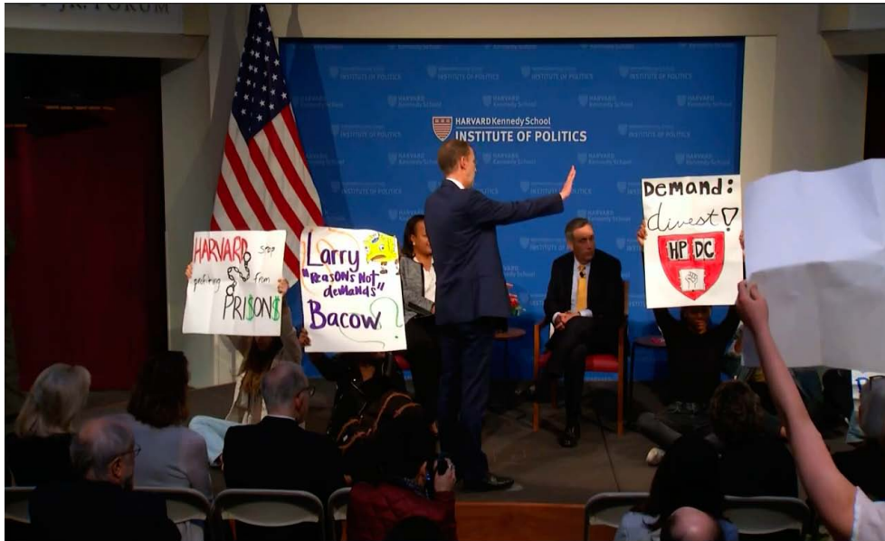
Dean Douglas Elmendorf speaking to protestors at the April 4, 2019 event at the Harvard Kennedy School Institute of Politics.

Dean Elmendorf’s permission to protest beside a stage informed the planning of the protest at the Fall HLS 2019 Reunion, especially because the Student Dissenters understood the Protest and Dissent Guidelines were designed to prevent another protest as aggressive as the one that took place at the Kennedy School. A reasonable dissenter, looking to exercise his right to free speech, could interpret the Protest and Dissent Guidelines to allow signholding without disruption. The Protest and Dissent Guidelines state “Displaying a sign, wearing significant/symbolic clothing, gesturing, standing, or otherwise protesting noiselessly is acceptable unless the protest interferes with the audience’s view or prevents the audience from paying attention to the speaker. Any use of signs, prolonged standing or other activity likely to block the view of anyone in the audience should be confined to the back of the room.” 97