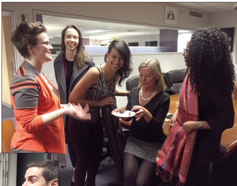
At the end of the meeting, we captured a few of last attendees who still hung around.